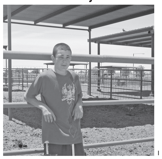
See a boy.