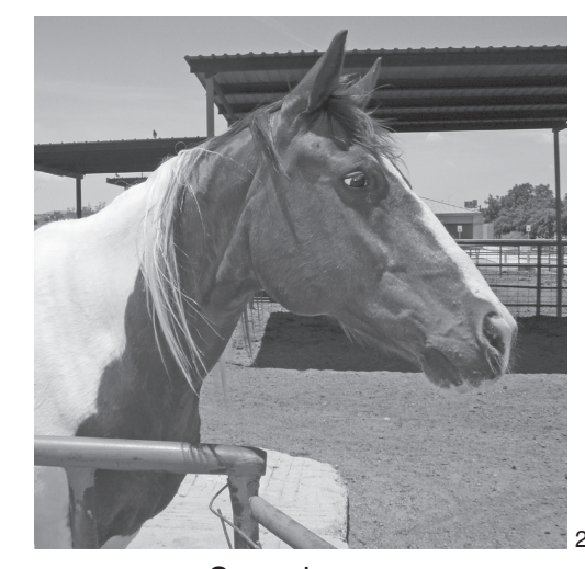
See a horse.