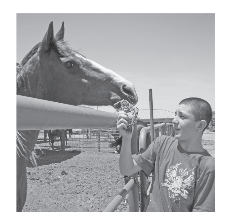
I see a boy and a horse.