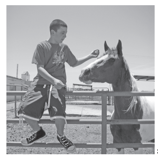
See a boy and a horse.